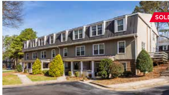
The Avenue Greensboro, North Carolina 503 Units // Built 1972