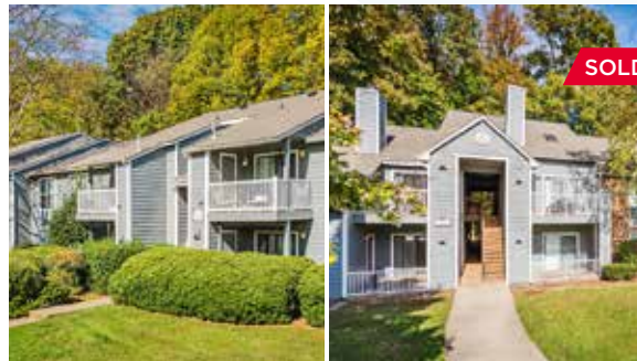
The Cypress & The Willow Greensboro, North Carolina 380 Units // Built 1986 & 1988