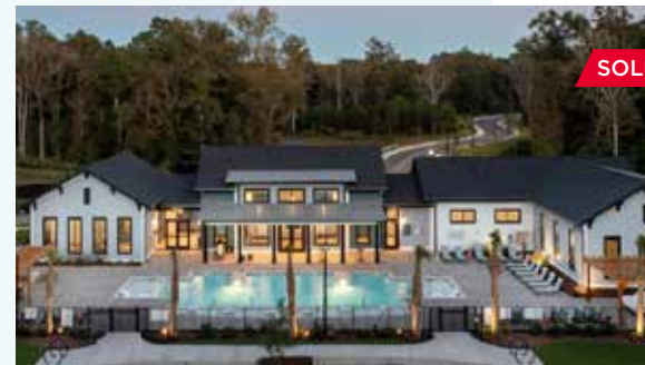
Broadstone Ingleside North Charleston, South Carolina 336 Units // Built 2021