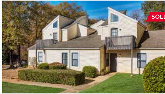
Flats at Arrowood Charlotte, North Carolina 301 Units // Built 1974