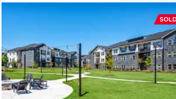
NOVO Mauldin Greenville, South Carolina 330 Units // Built 2021