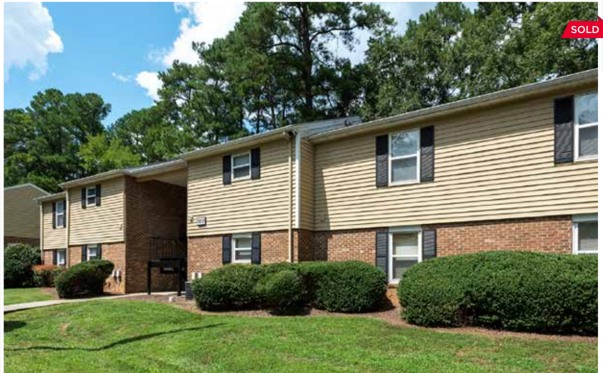
North Oaks Landing Raleigh, North Carolina 200 Units // Built 1980

Associate +1 919 792 6143 bo.mchugh@cushwake.com