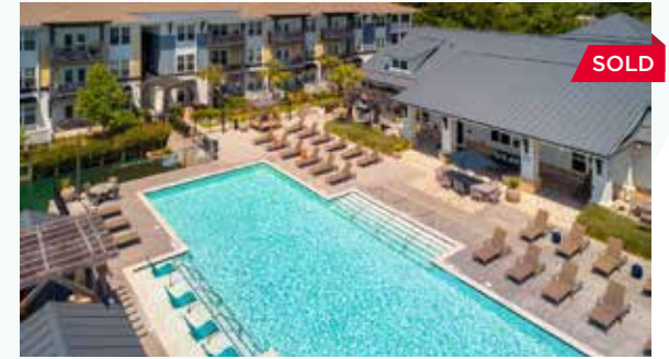
Spyglass Seaside Charleston, South Carolina 294 Units // Built 2016