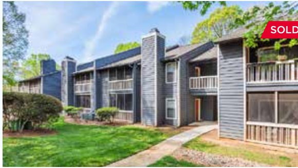
Pointe at Irving Park Greensboro, North Carolina 198 Units // Built 1987