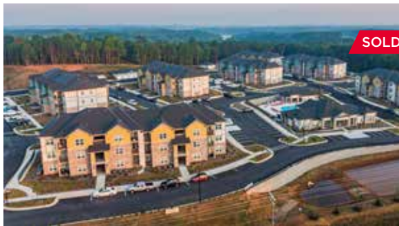
Waypointe West Charlotte, North Carolina 192 Units // Built 2021