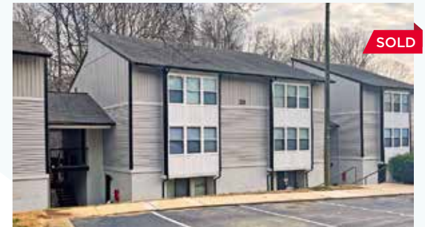
Lynnwood Park Raleigh, North Carolina 152 Units // Built 1982