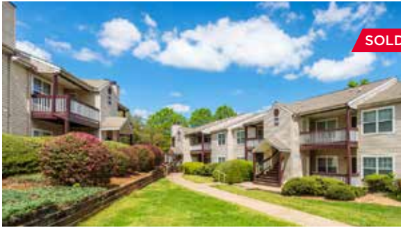
Upstate Value-Add 5 Portfolio Greenville & Spartanburg, South Carolina 912 Units // Built 1974-1986