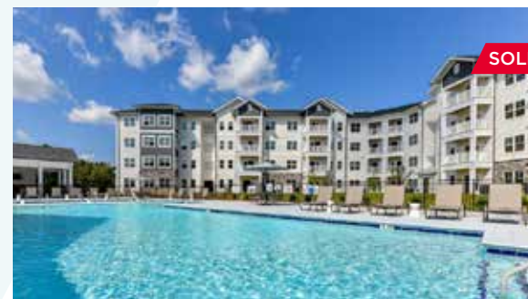
Retreat at Arden Farms Asheville, North Carolina 312 Units // Built 2021