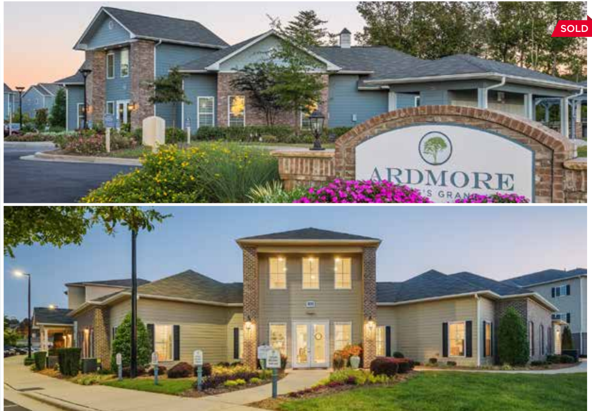
Ardmore King's Grant & Ardmore Cates Creek Charlotte & Raleigh, North Carolina 627 Total Units // Built 2015 & 2016