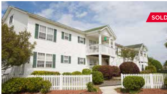
Deerbrook Wilmington, North Carolina 252 Units // Built 1999