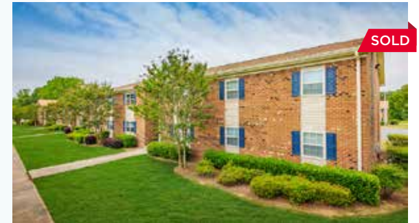
Marquis Gardens Durham, North Carolina 400 Units // Built 1972