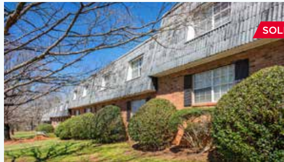
Park West Greenville, South Carolina 359 Units // Built 1972