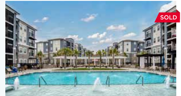
Lively Indigo Run Ladson, South Carolina 302 Units // Built 2018