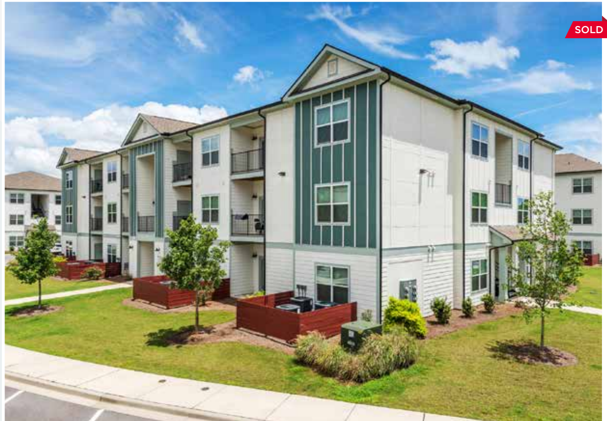
Exchange at Windsor Hill North Charleston, South Carolina 312 Units // Built 2020