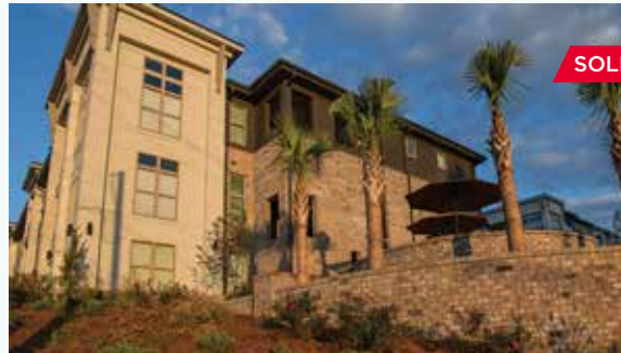
5000 Forest Columbia, South Carolina 126 Units // Built 2014