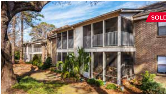
Granby Oaks West Columbia, South Carolina 148 Units // Built 1973