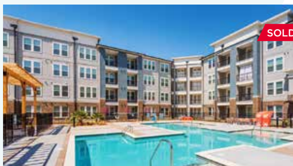
Mosby University City Charlotte, North Carolina 309 Units // Built 2021