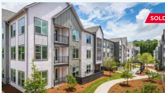
Monty North Charleston, South Carolina 300 Units // Built 2021