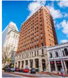
Main Street 4 Portfolio Columbia, South Carolina 176 Units // Built 1903-1940