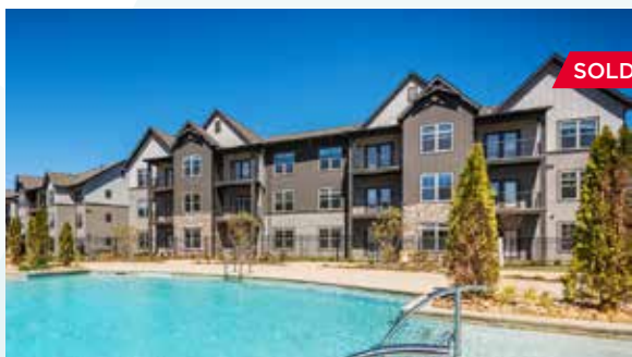
The Holston Asheville, North Carolina 238 Units // Built 2022