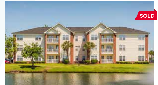
Seaside Grove at Carolina Forest Myrtle Beach, South Carolina 312 Units // Built 2002