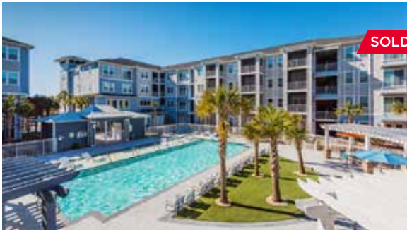
Lively at Carolina Forest Myrtle Beach, South Carolina 305 Units // Built 2017