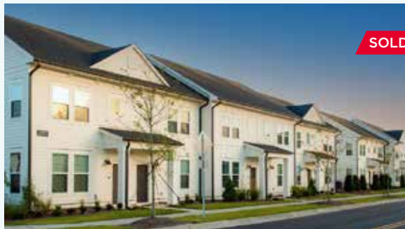
Woodlands Landing Echo Farms Wilmington, North Carolina 176 BTR Units // Built 2020