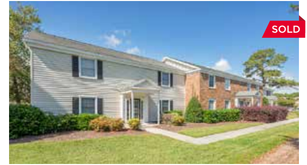
Preserve at Pine Valley Wilmington, North Carolina 219 Units // Built 1974