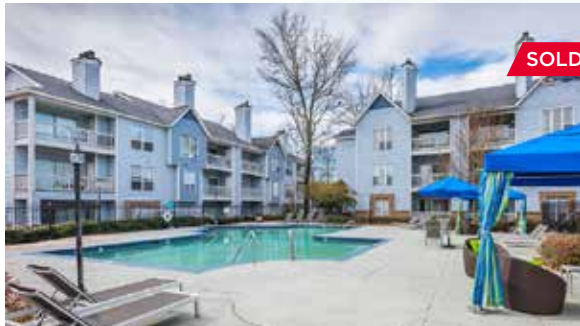
Axiom Charlotte, North Carolina 202 Units // Built 1987