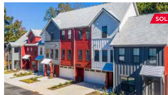
Anker Haus Charlotte, North Carolina 49 BTR Units // Built 2020